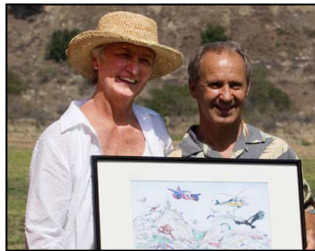
Attendees were given drawings.