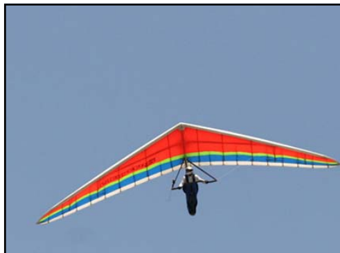
A participant takes a flying lesson.